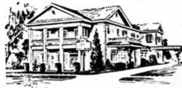
COLONIAL GARDEN CHAPEL

Our Services are tempered with Kindness and Consideration for those whom we serve.