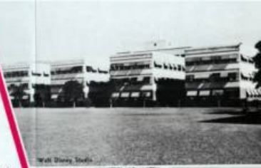
Walt Disney Studio

This city is the home of some of the most famous names in industry. It literally teems with the activity of several hundred small plants. It is famed as an aircraft and motion picture center. The Lockheed Aircraft Corporation is here. Warner Brothers Studio, occupying 120 acres, is the largest in the world. The Walt Disney Studio covers 51 acres. Columbia Pictures Corporation has 80 acres for outdoor shooting. Articles made in Burbank besides airplanes and motion pictures include furniture, flashlights, washing machines, water heaters, ceramics, phonograph records, hydraulic equipment, air conditioning machinery, soap and toilet articles, cabinets, ice cream, dehydrated foods, plastics, chemicals, instruments, canning, tools and dies.