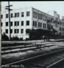
Andler Jergens Co.