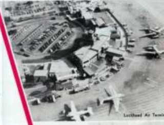
Lockheed Air Terminal